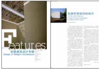
id+c. Interior design and construction , P.R. China, Nov. 2008 “Design of Religion Architecture” by Samuele Martelli, pp.88-91;