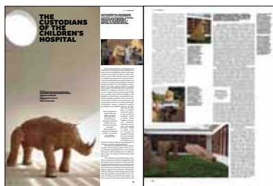
DOMUS n. 934, March 2010 "The custodians of the children's hospital" pp. 33-35.