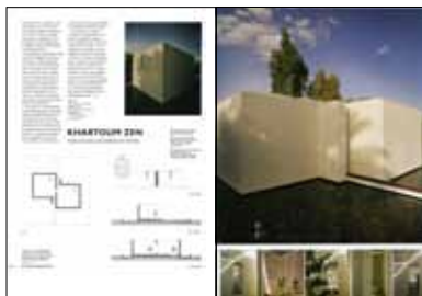
THE ARCHITECTURAL REVIEW , Volume CCXXII n. 1330, UK Dec. 2007 “Khartoum zen, a place of prayer and meditation for all faiths”, pp. 48-49.