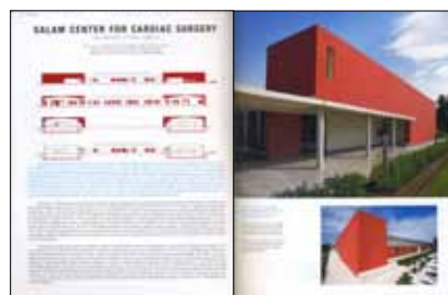
Green architecture now! , Jodidio Philip, Taschen Editors, 2009.