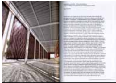
"South Out There; progetti per il sud del mondo: acqua, igiene e salute", 11° Venice Architecture Biennial, San Marino Republic Pavillion Catalogue, 2008, pp. 50-54.