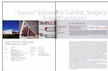
ItaliArchitettura - Vol. II Edited by: Prestinenza Puglisi Luigi; Editore: Utet Scienze Tecniche, 2009.