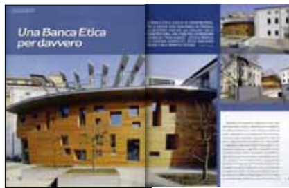
CASA E CLIMA , Anno II n. 7, April 2007: “Una banca etica per davvero” by Aldo Romagna, pp. 40-45.