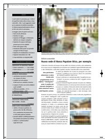
Architettura sostenibile. Una scelta responsabile per uno sviluppo equilibrato , a cura di Gianluca Minguzzi, Skira Editore, Nov. 2008; “Nuova sede di Banca Popolare Etica, Padova” by Tamassociati, pp. 152-157.