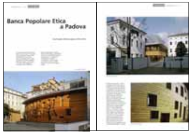
Paesaggio urbano , Anno XVI n. 5, Sept.-Oct. 2007: “Banca Popolare Etica a Padova”, pp. 52-55.