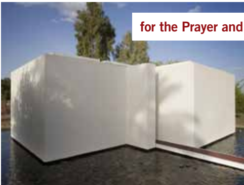
for the Prayer and Meditation Pavillion in Khartoum, Sudan: