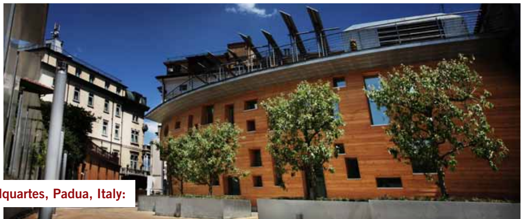
for Banca Etica Headquartes, Padua, Italy: