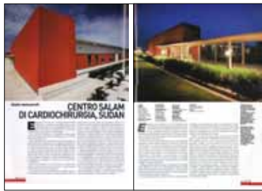
L'ARCA n. 240, Oct. 2008 “Centro Salam di Cardiochirurgia, Sudan”, pp. 62-69.