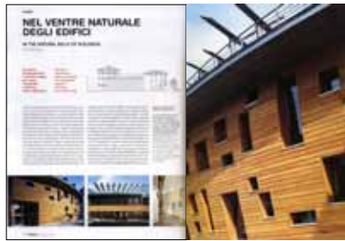
OTTAGONO , Anno XLIII n. 209, April 2008: “Nel ventre naturale degli edifici” by Elisa Montalti, pp. 218-219.