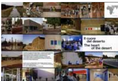
DOMUS , n. 912, March 2008: “Il cuore del deserto” by Francesca Picchi, pp. 20-27.