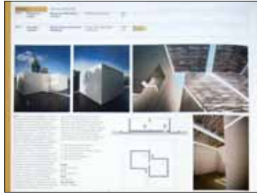
The Phaidon Atlas of 21st Century World Architecture. The best 21st century architecture from all over the world. Phaidon Editors, 2009.