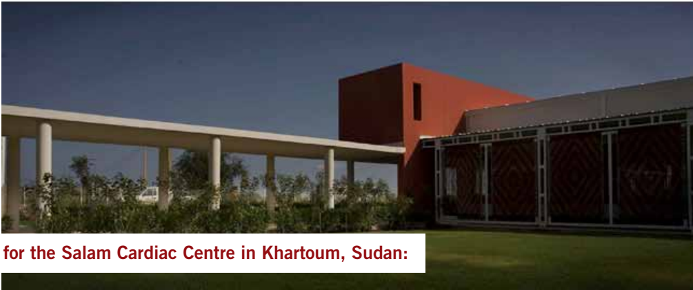
for the Salam Cardiac Centre in Khartoum, Sudan: