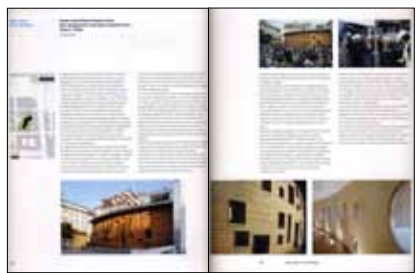
SE/AS3 Edilizia sostenibile II Ed. 68 Progetti bioclimatici. Analisi e parametri energetici Sistemi Editoriali, 2008 “Nuova sede amministrativa di Banca Popolare Etica, Padova”, pp. 162-163.